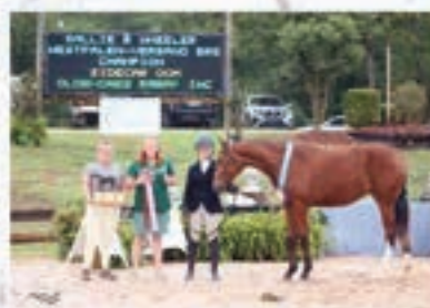
Sidecar OOM (granddaughter)