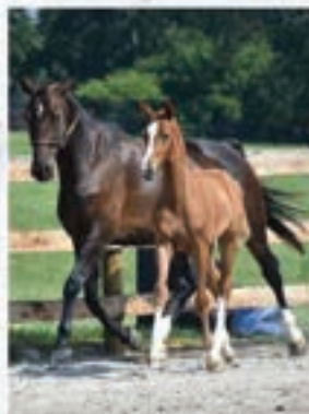
Classical Shine OOM