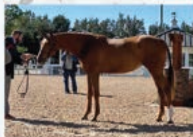
Everlasting Shine OOM