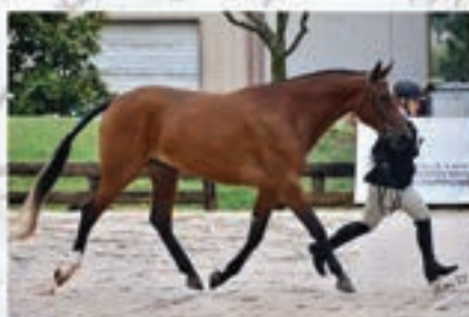
Shine a Light