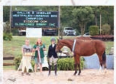
Sidecar OOM (granddaughter)