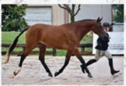
Shine a Light