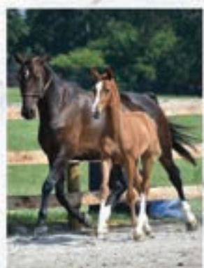
Classical Shine OOM