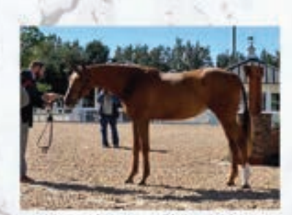
Everlasting Shine OOM